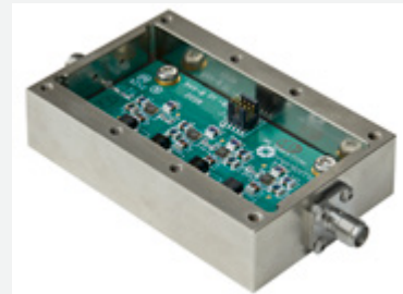
FIG. 2 Filter PCB